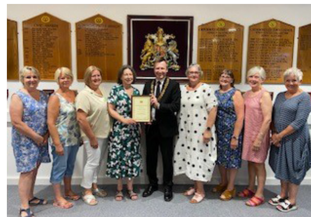
Sewing Crow-Bees receiving their Civic Award in June 2023

Nominations can be made by either members of the public or councillors, and all nominations are considered by the Communication & Events Committee. Full details about how to apply are included in the council's Civic Awards Policy which is available on our website ( www.crowboroughtowncouncil.gov.uk ) or by emailing info@crowboroughtowncouncil.gov.uk .